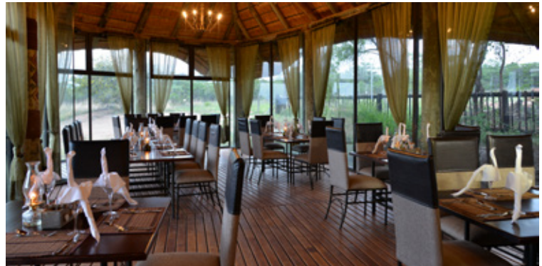
FIG TREE (OUTDOOR VENUE)

For a more formal occasion, the Mvubu Deck is the ideal venue for an intimate gala dinner.