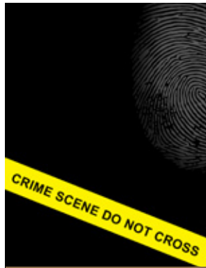
MURDER MYSTERY DINNER