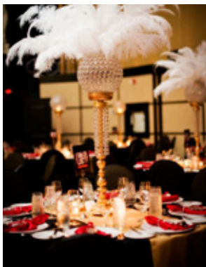
OLD HOLLYWOOD DÉCOR